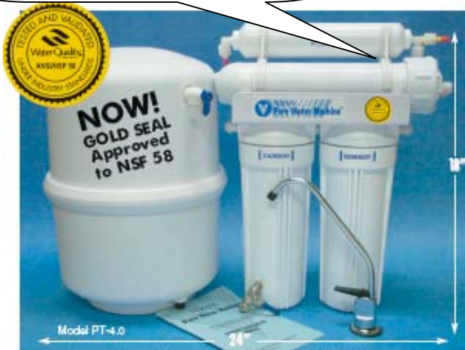
Compact 4 Stage Design Easily Fits Under Sink.